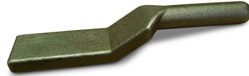
GD-0200-1 REC BASE PIN