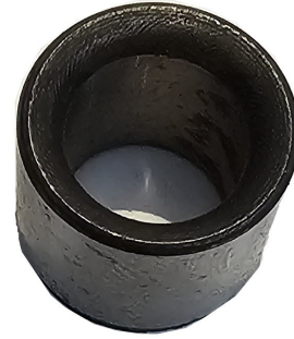
HEADED & HEADLESS PRESS FIT BUSHINGS ( ISO 4247, DIN 172 & DIN 179 )