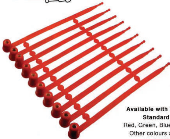
FLYED LENGTH SEAL AVAILABLE WITH BARCODES

Available with barcode Standard colours Red, Green, Blue, Yellow Other colours available on quantity orders