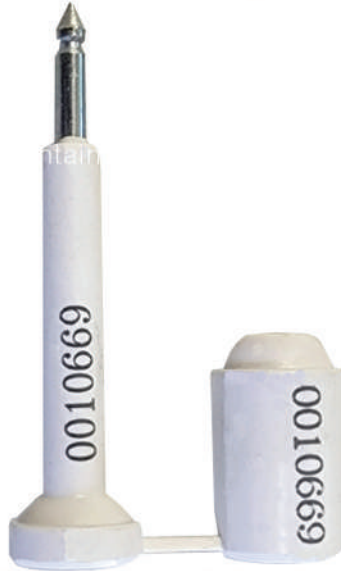
SMALL BOLT SEAL

Available with barcode Standard colours Red, Green, Blue, Yellow Other colours available on quantity orders