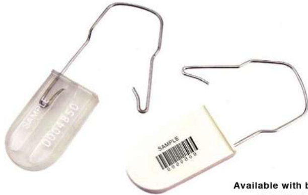
HASP LOCK SEAL

Available with barcode Standard colours Red, Green, Blue, Yellow Other colours available on quantity orders